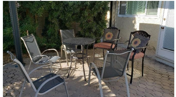
The Yard Sale chairs and table.